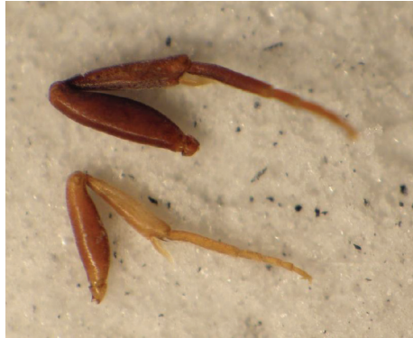
Fig. 1. Fore legs of two Platythyrea species. Upper: Platythyrea sp.2, Lower: Platythyrea sp.3