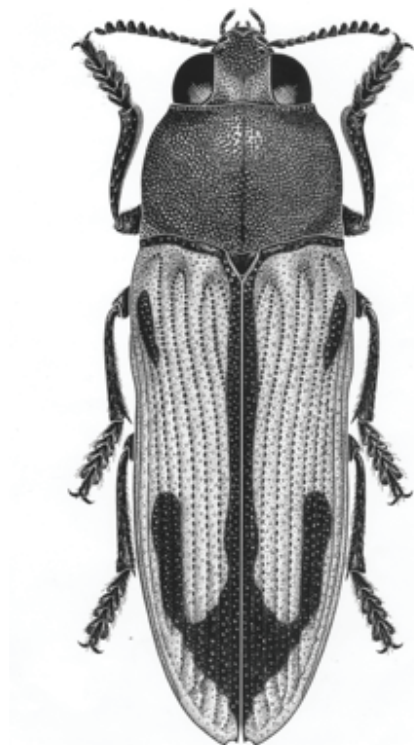
Figure 10. Winner of the Inaugural 1985 Australian Entomology Society Scientific Illustration prize, Rudy's drawing of a jewel beetle (Buprestidae)