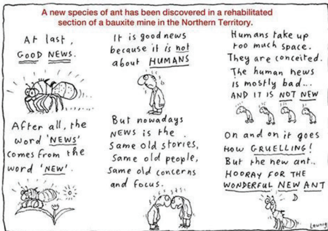
Figure 15. A cartoon by celebrating the description of Polyrhachis kohouti